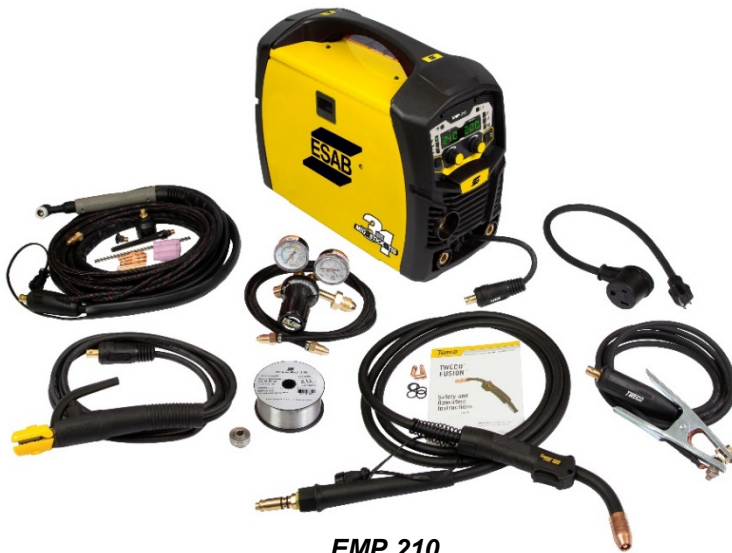
EMP 210 Multi-Process MIG/Stick/DC TIG Welding System Package

ESAB EM 210 and EMP 210 inverter-based welding systems are ready to tackle steel, stainless and aluminum projects. Featuring professional-grade arc characteristics and full-featured digital controls which enable fine-tuning of the arc performance to deliver superior welds. Both systems weight just 29 lbs. and offer dual-voltage 120/230V flexibility. Take these welders wherever work takes you – around the shop, in the field or at home in your garage.