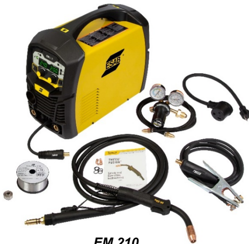
EM 210 MIG/Flux-Cored Welding System Package